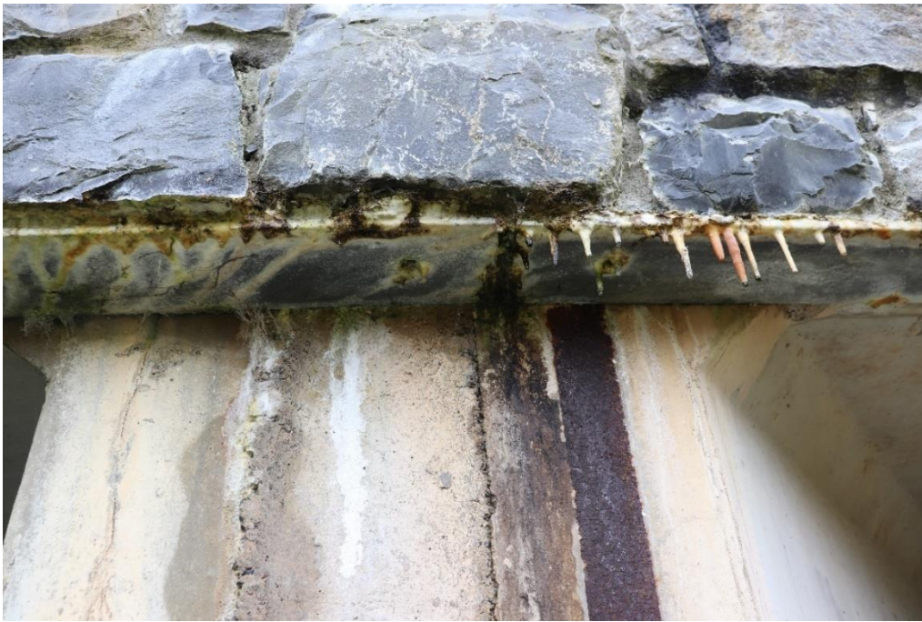
Figure 19 - Stalactites and Staining on Parapet Edge Beam