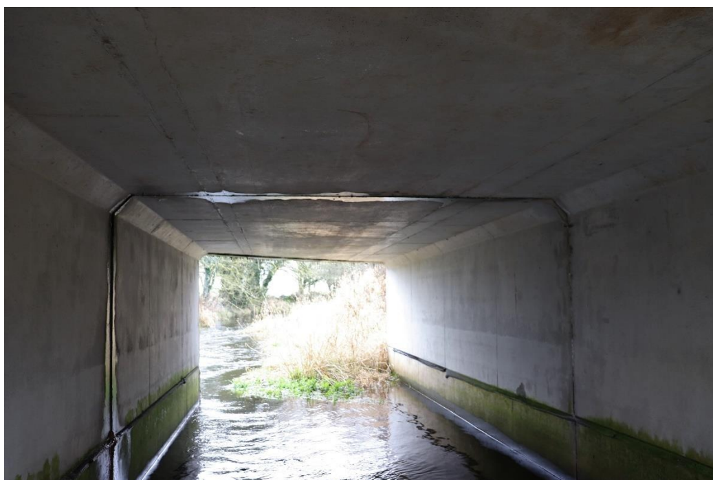
Figure 14 - North Span Internal