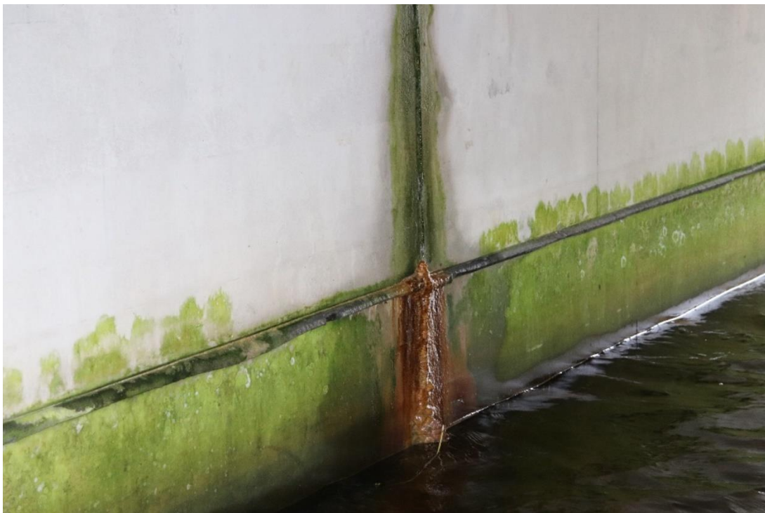
Figure 30 - Heavy Leaching and Material Build-up on North Pier