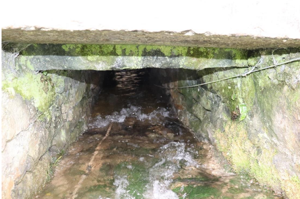
Figure 43 – Southern Culvert