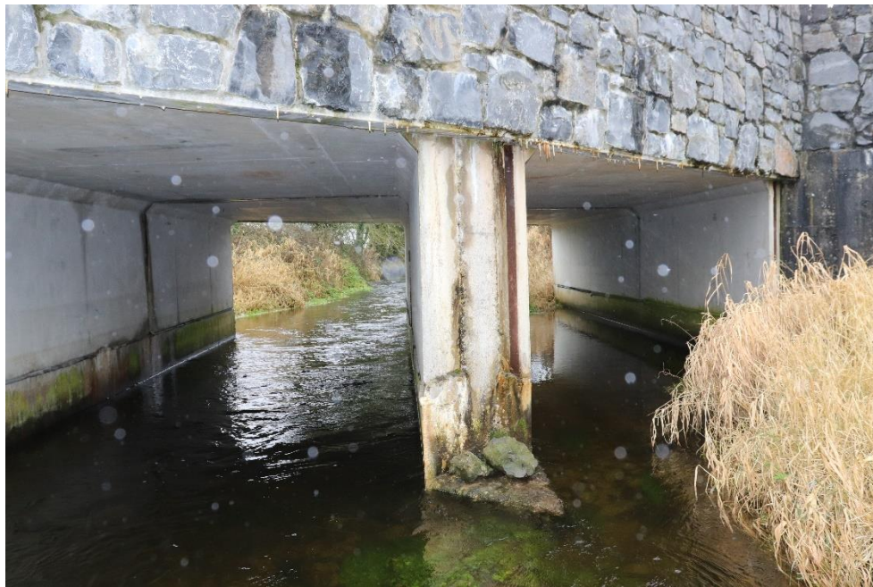
Figure 12 - North Span, Central Span and South Pier