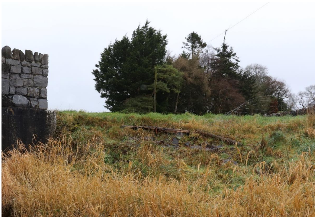
Figure 20 - Fallen Timber Post and Mesh Fence