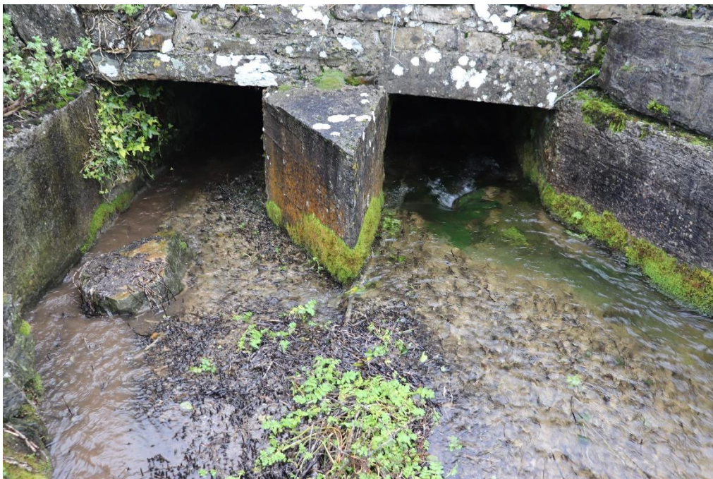
Figure 46 – Riverbed