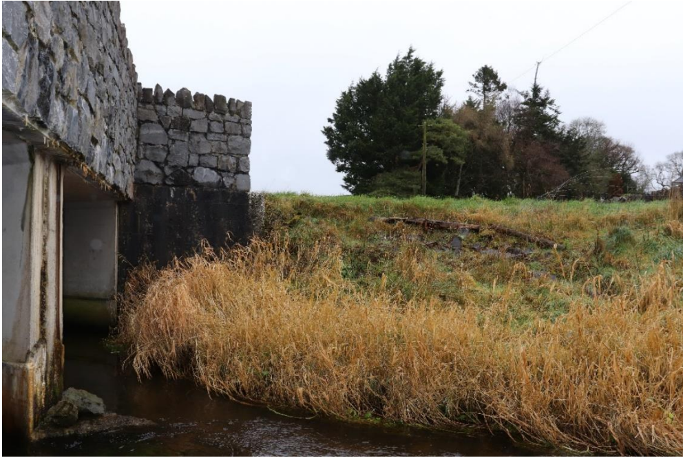
Figure 15 - North East Wingwall and Embankment