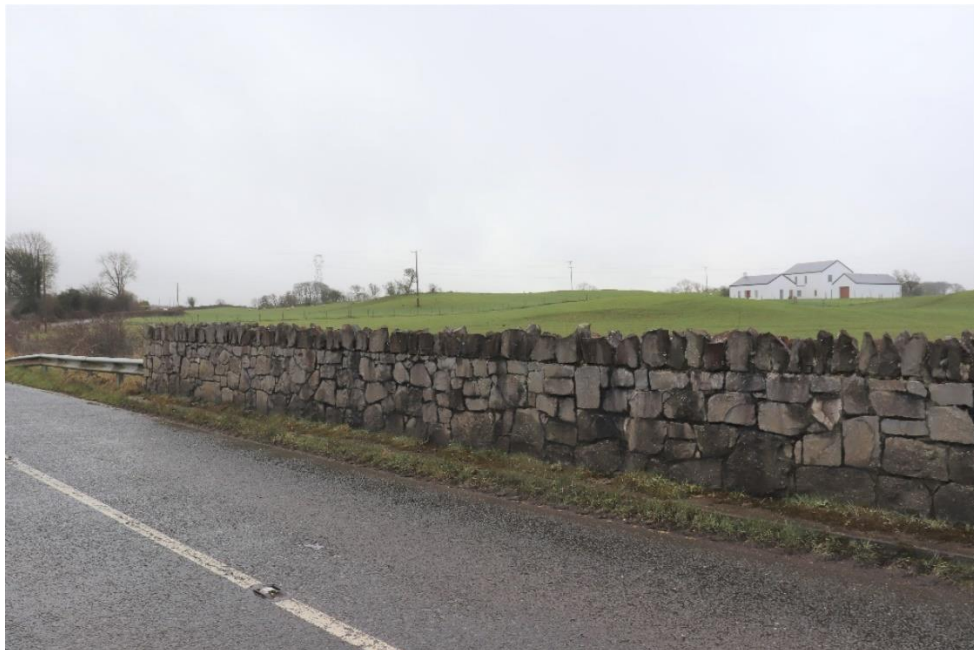
Figure 8 - Parapet Arrangement