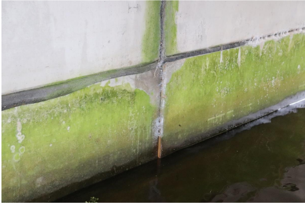
Figure 27 - Position Difference in South Abutment at Vertical Joint