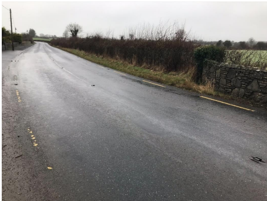
Figure 36 – Surfacing looking North