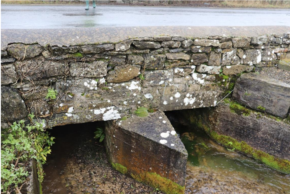
Figure 41 – Central Pier