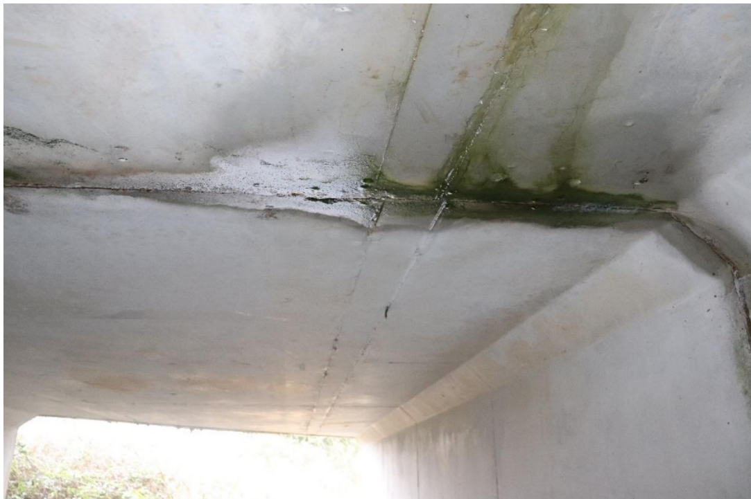
Figure 32 - Leaching and Water Seepage on Soffit of South Span