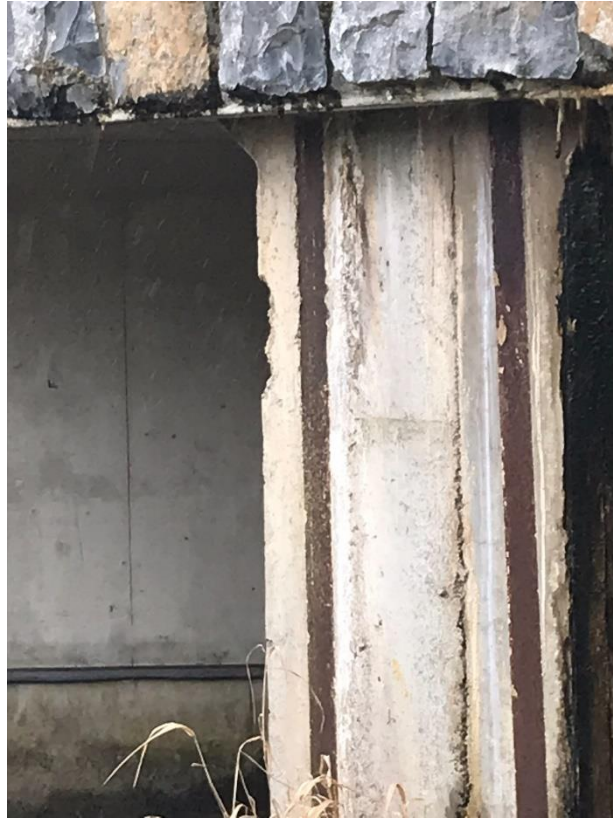
Figure 29 - Damage and Concrete Loss to South Pier