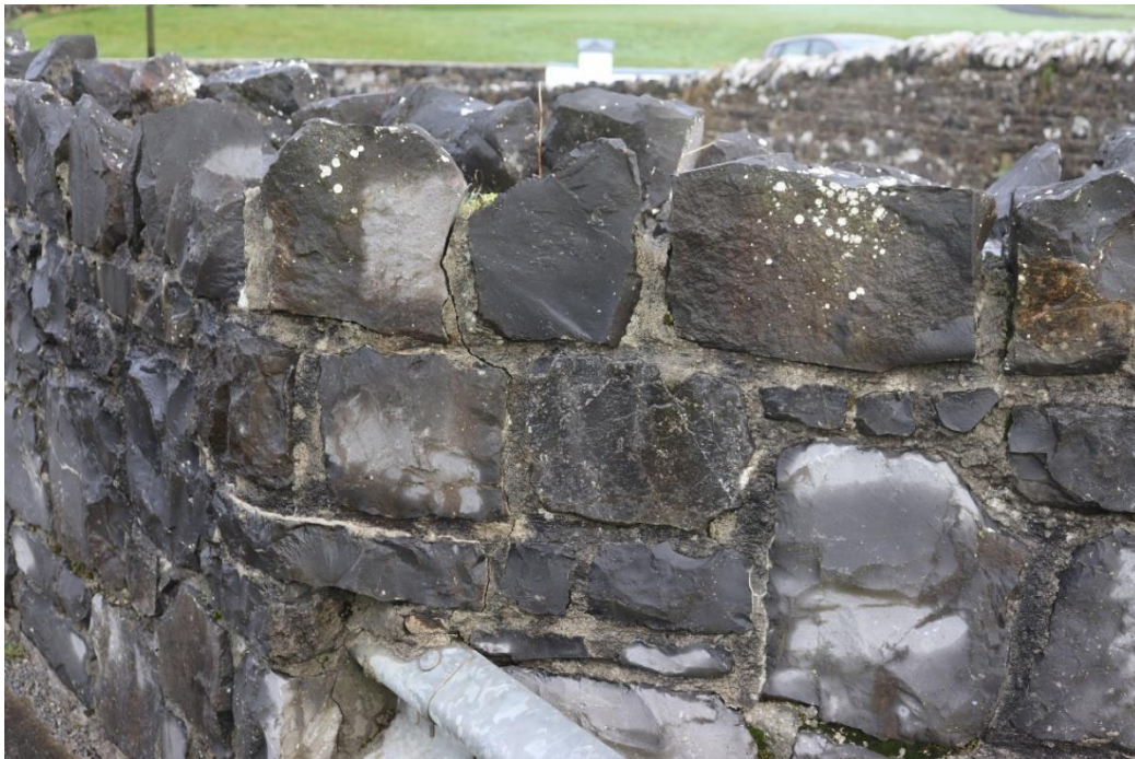
Figure 18 - Cracking of Masonry Pointing