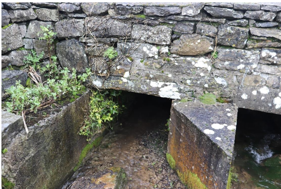
Figure 44 – Transverse Capping Stone on Northern Culvert