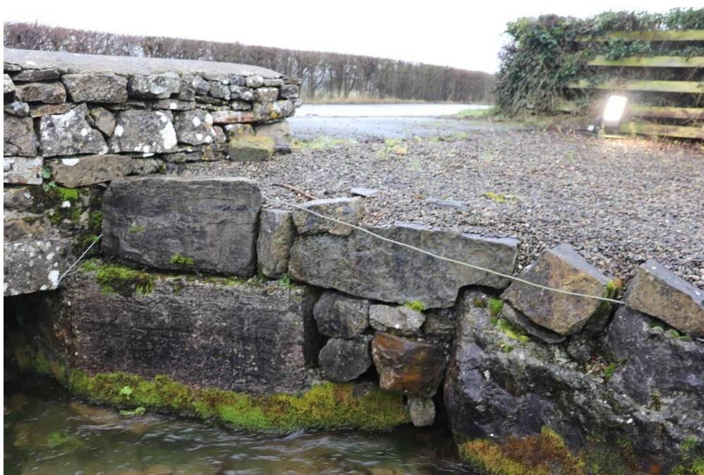
Figure 40 – Southwest Wingwall and Abutment