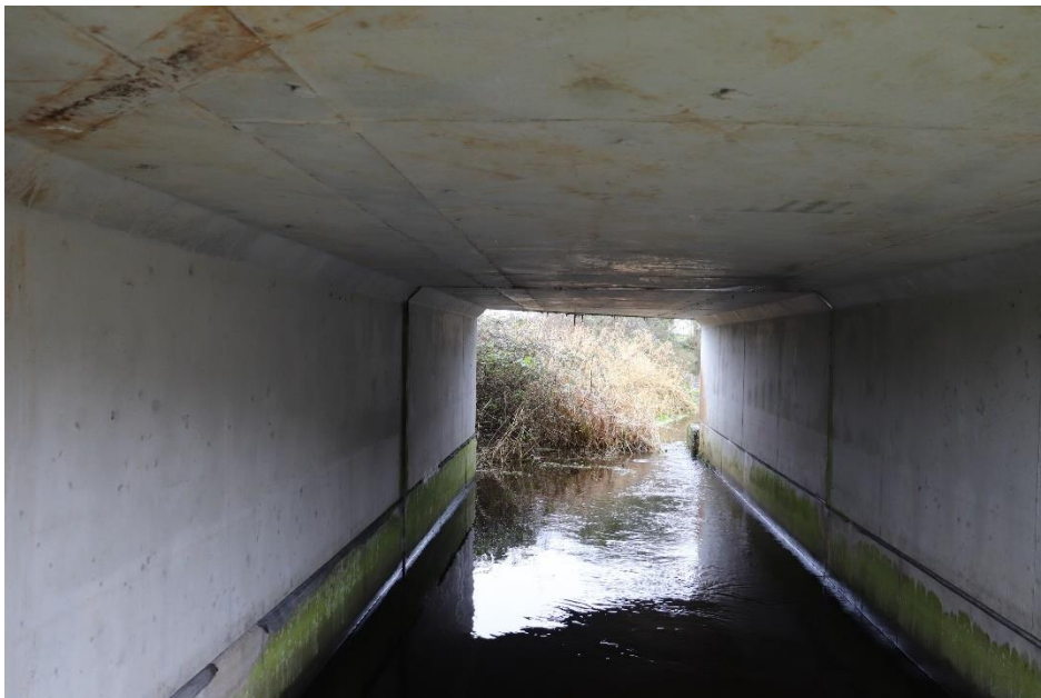
Figure 10 - South Span Internal