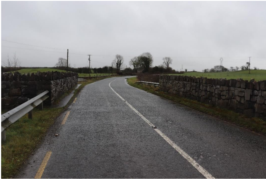
Figure 7 – Surfacing