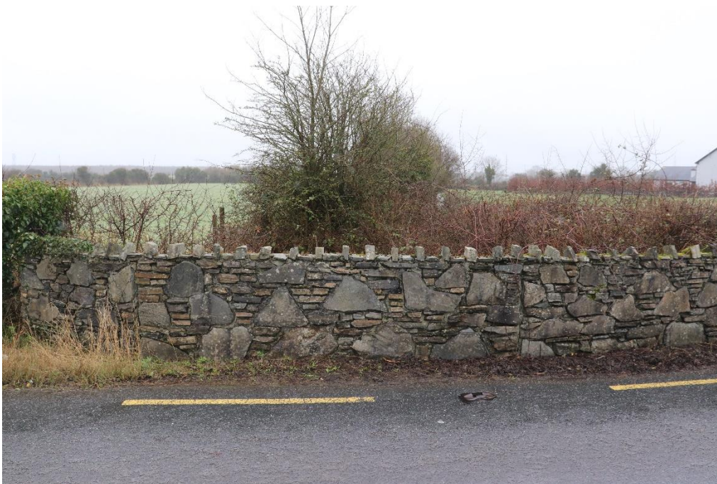
Figure 39 – East Parapet