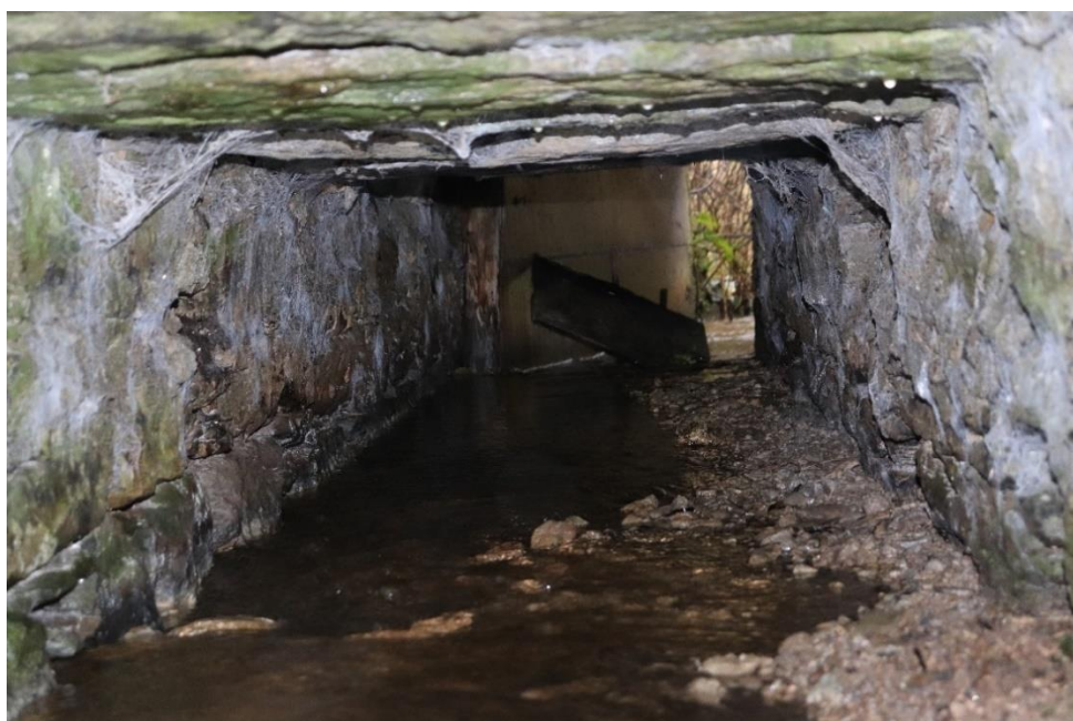
Figure 49 – Debris and Silt Build-up in Riverbed