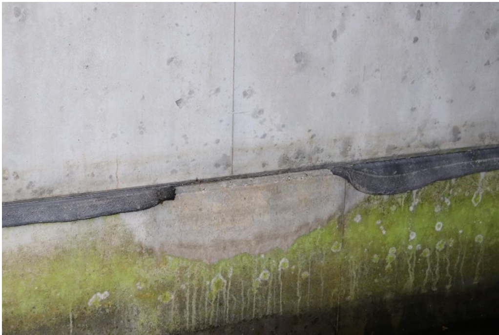
Figure 23 - South Abutment Joint Filler Loss