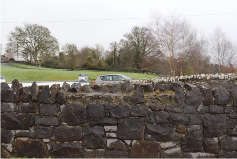
Figure 17 - Loss of Masonry Facing