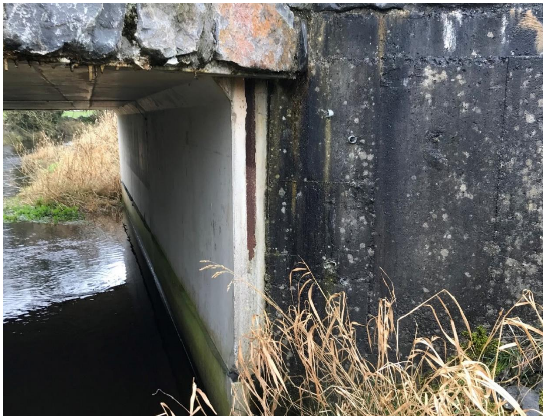
Figure 34 - Concrete Spalling around Corroded Steel Strips