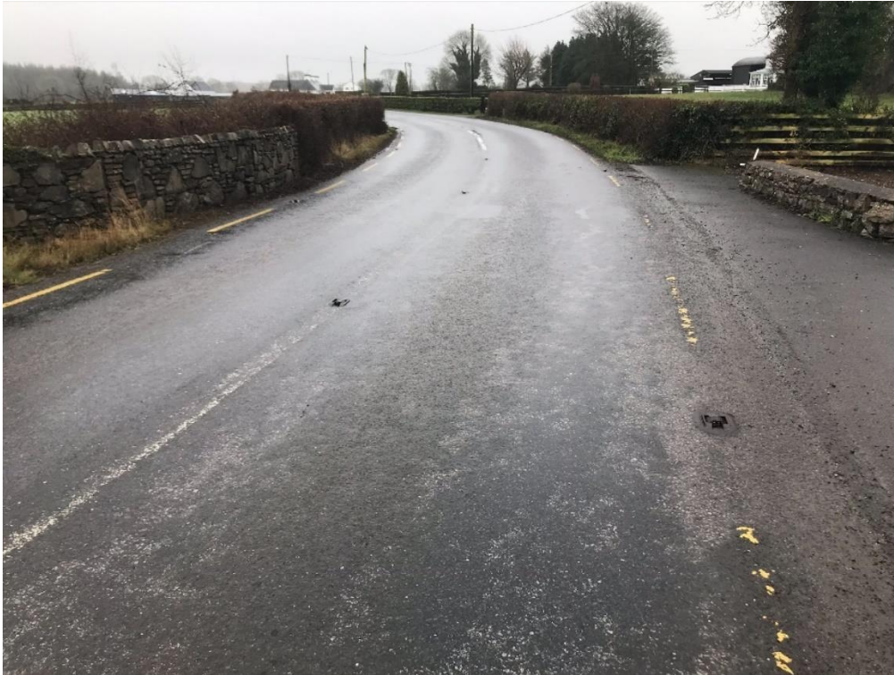
Figure 37 – Surfacing looking South