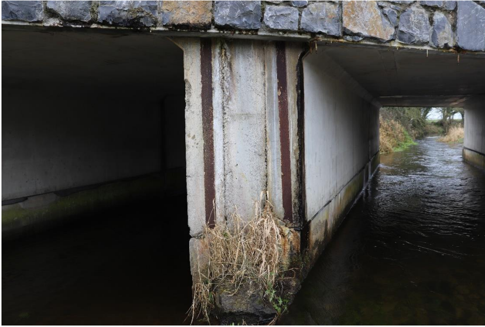
Figure 11 - South Pier