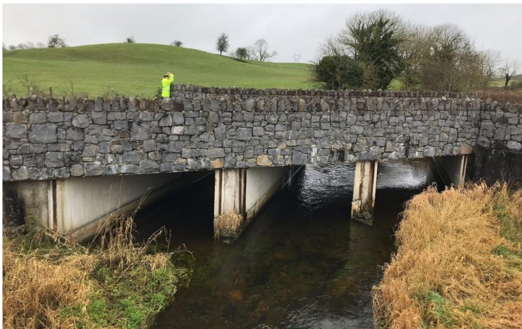
Figure 5 – East Elevation