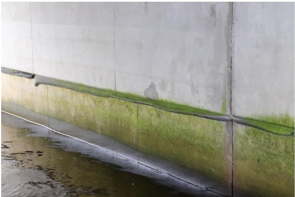
Figure 25 - Spalling of Concrete on North Abutment