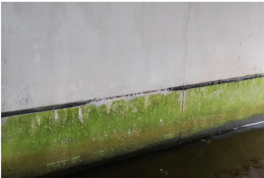
Figure 24 - South Abutment Additional Joint Filler Loss