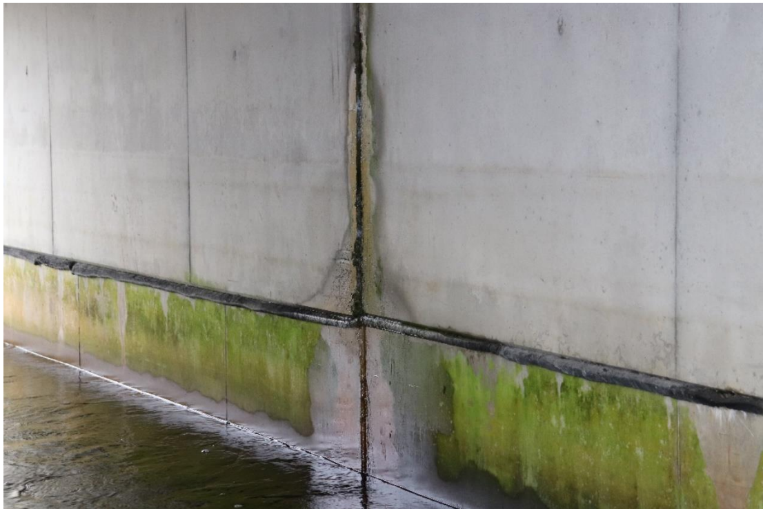
Figure 31 - Position Difference in North Pier at Vertical Joint