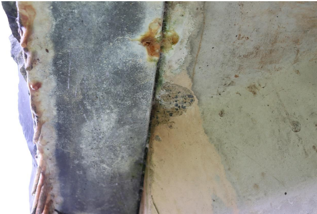
Figure 33 - Damage and Concrete Loss to Soffit of North Span