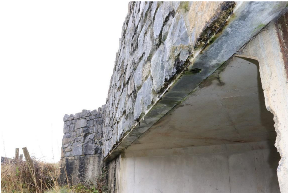
Figure 16 - South East Wingwall and Parapet Edge Beam