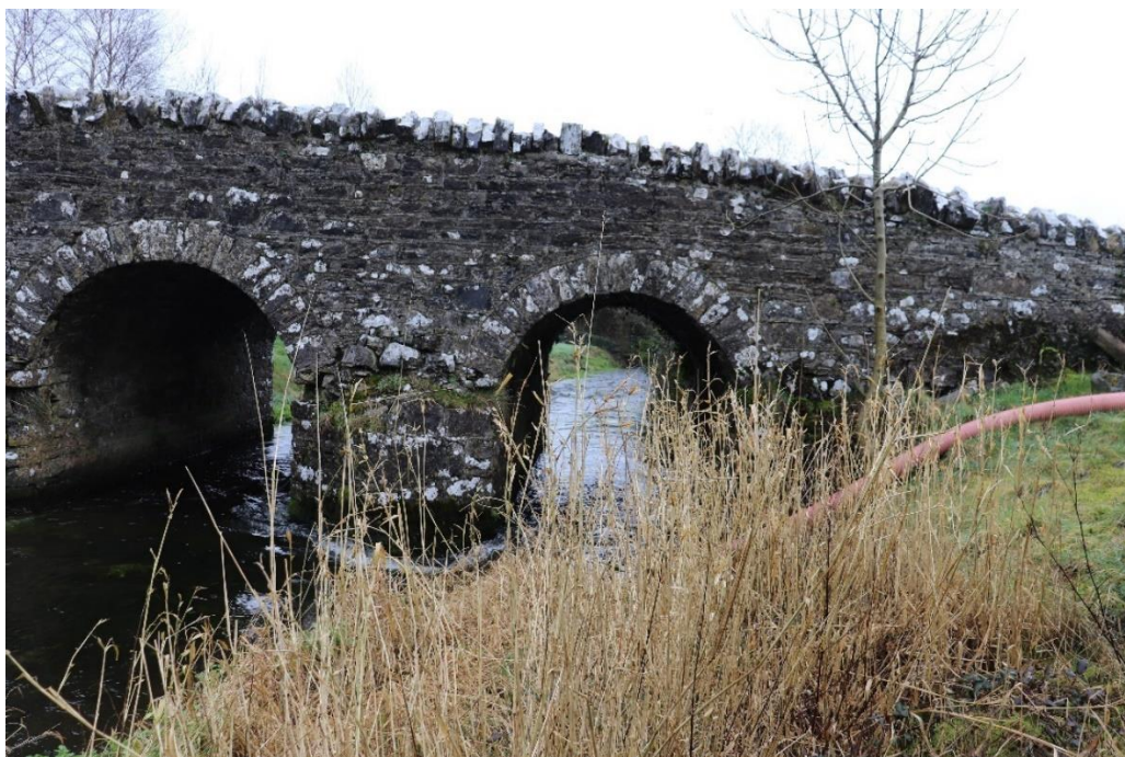
Figure 21 - Pipe on River Embankment Downstream of ST01 (Masonry Arch Bridge visible here is parallel to ST01 and not included in this inspection)