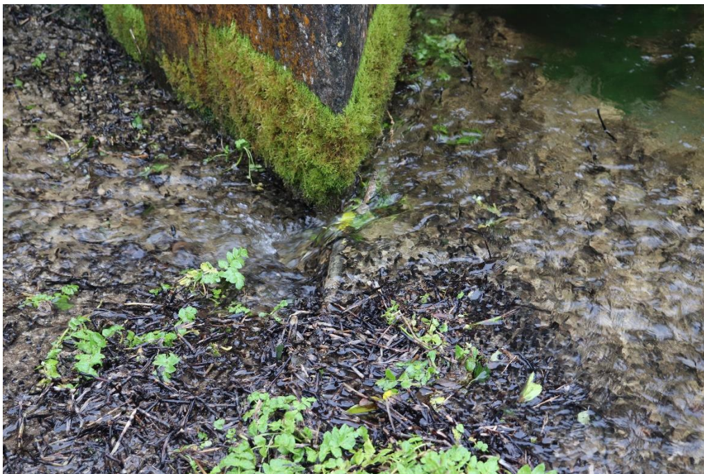
Figure 47 – Service Duct