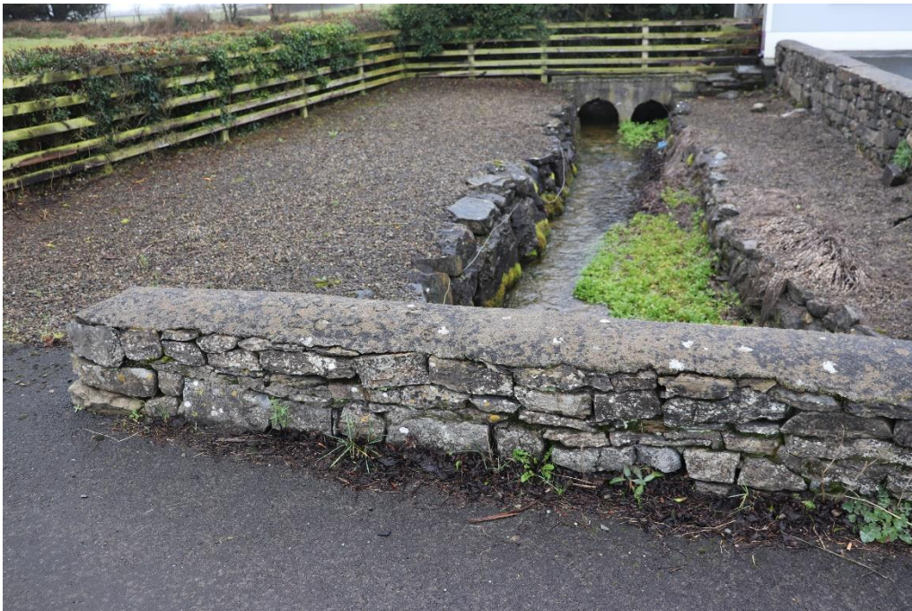
Figure 38 – West Parapet