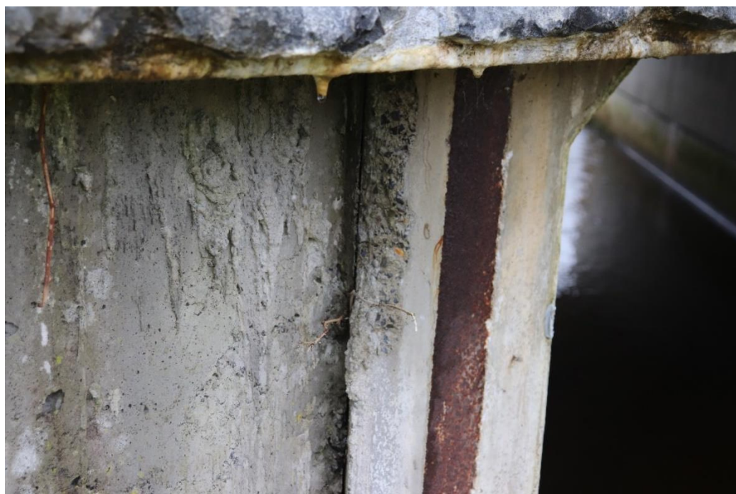
Figure 22 - Damage and Concrete Loss to South Abutment