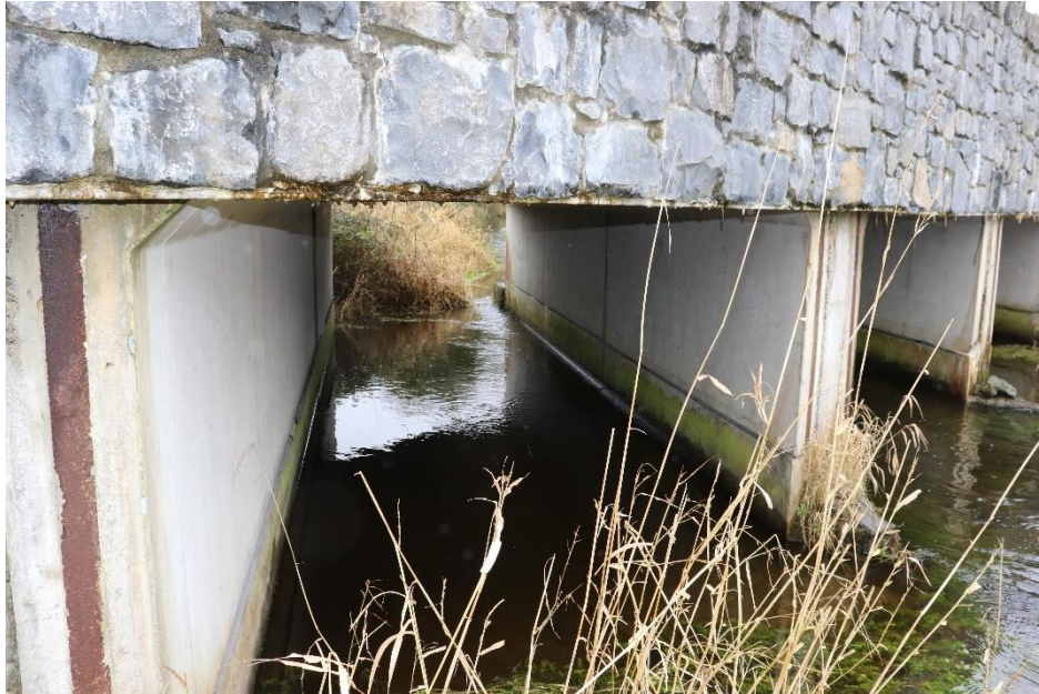
Figure 9 - South Span External