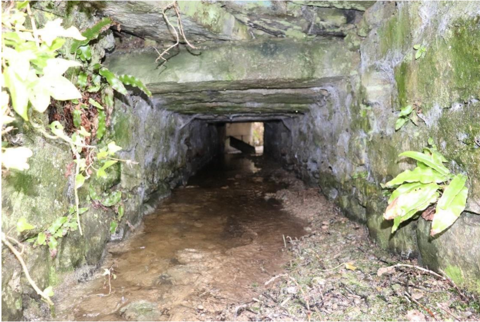
Figure 45 – Northern Culvert