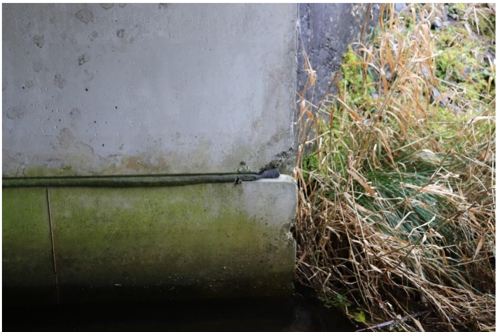
Figure 26 - Damage and Concrete Loss to North Abutment