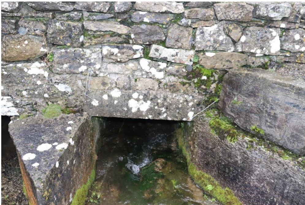
Figure 42 – Transverse Capping Stone on Southern Culvert