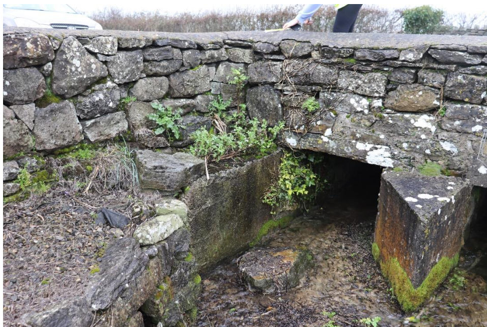
Figure 48 – Northwest Wingwall and Abutment with Vegetation Growth