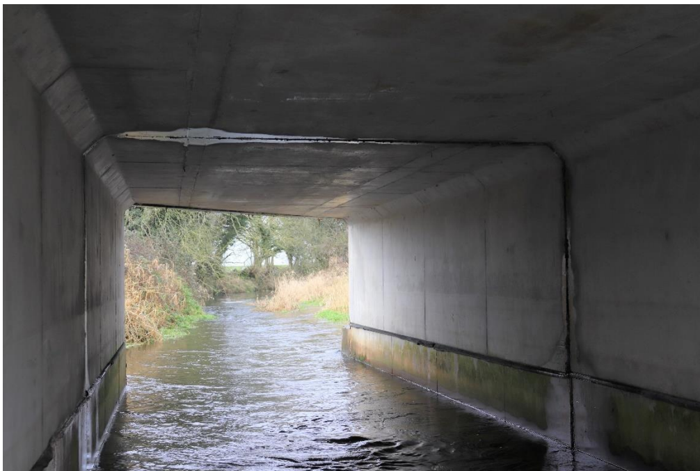
Figure 13 - Central Span Internal