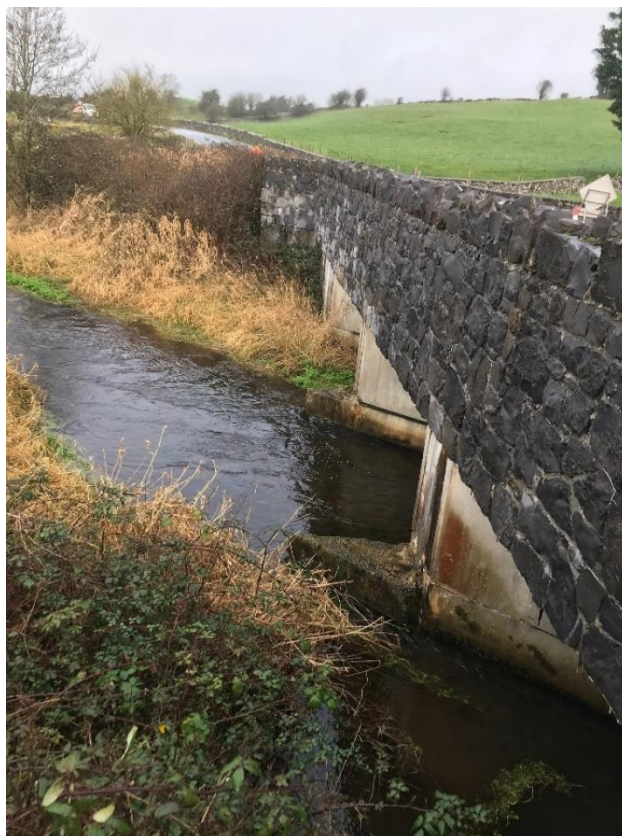
Figure 6 - West Elevation