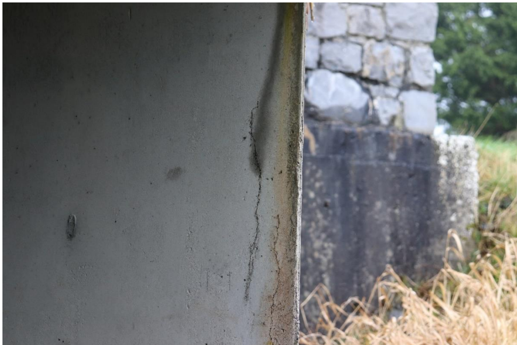
Figure 28 - Cracking in North Pier