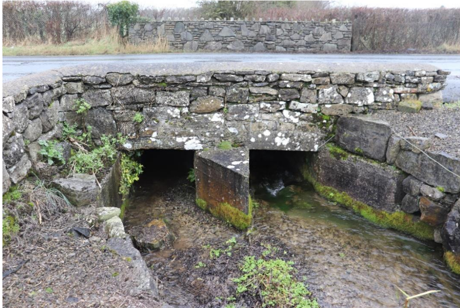
Figure 35 – West Elevation